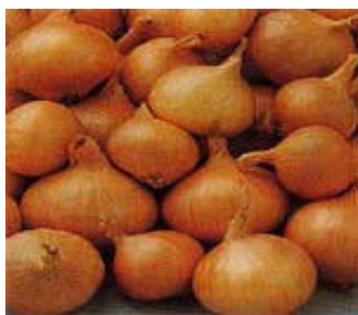
Sturon Golden Onions.