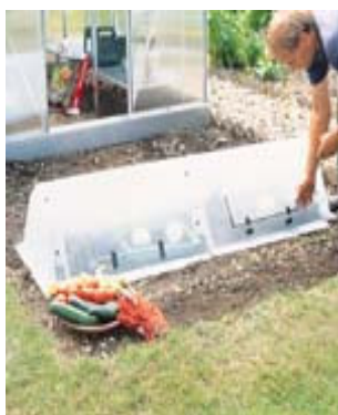
Protect Your Vegetable Plants With a Garden Cloche.