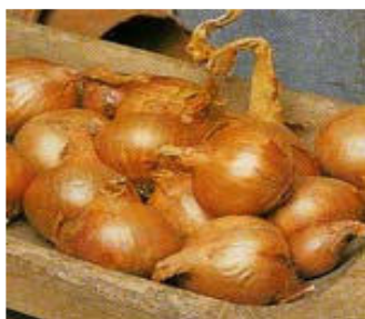
Longor long Shallots.