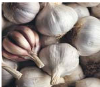
Garlic to Plant Now.