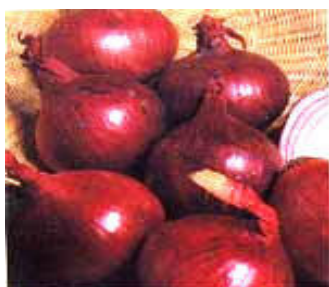
Red Baron Onion Sets.